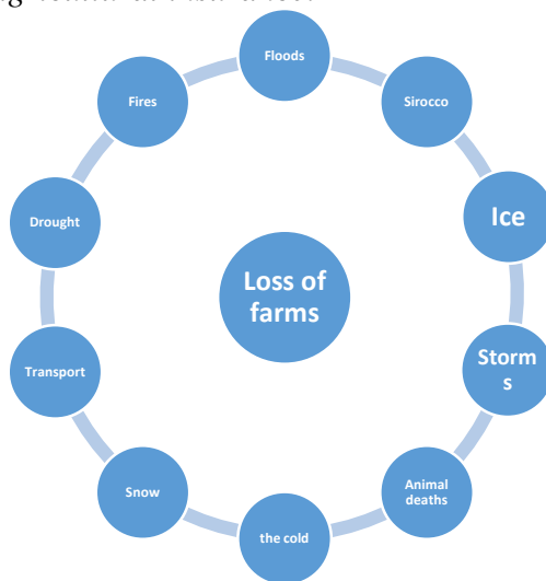
Fig.1 : Some of the dangers faced by farmers, which push them to carry out the process of agricultural insurance:

Agricultural insurance remains the only way to prevent these risks